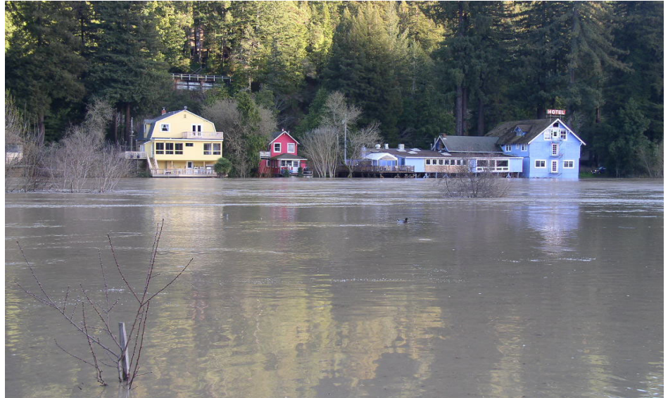
Flooding on the Russian River northwest of San Francisco, Feb. 17, 2004