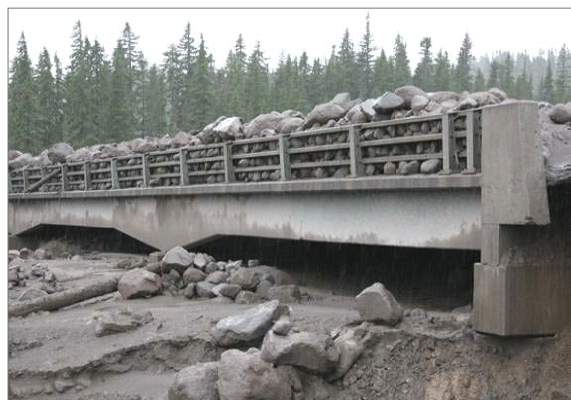
Aftermath of flooding and debris flow on the White River Bridge in Oregon.