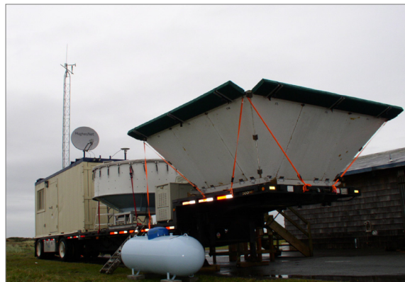
A mobile Atmospheric River Observatory (ARO) deployed in Westport, WA. ARO measurements include winds, water vapor, the altitude at which snow turns to rain, cloud structure, and rainfall. Data products are available to the public at: http://www.esrl.noaa.gov/psd/data/obs/ .

Physical Sciences Division 325 Broadway Boulder, CO 80305