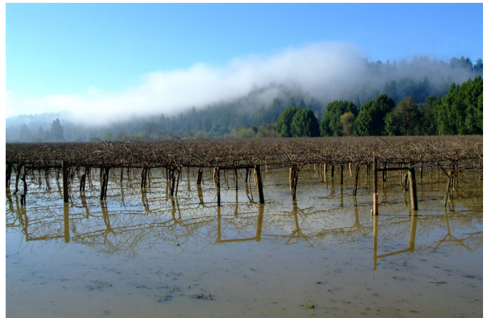
Torrential rain from a severe winter storm causes the Russian River to spill over into this vineyard in Sonoma County, CA.