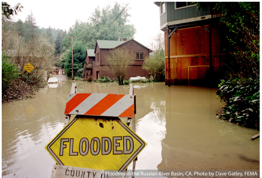
Flooding in the Russian River Basin, CA.