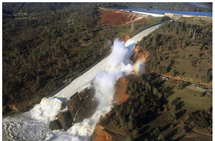
Extreme precipitation from several ARs contributed to a flood risk management crisis at California's Oroville Dam in early 2017.