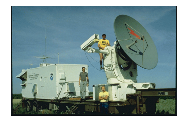
Figure 1. The NOAA/ETL X-band radar.

Corresponding author address: Brooks Martner, NOAA/ETL, 325 Broadway, Boulder, CO, 80305, USA; email: brooks.martner@noaa.gov